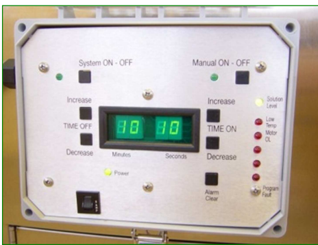
Piian Digital Control Panel

Built using stainless steel and Lexan materials and industrial quality components our system is tough and reliable, with only one moving part it has virtually no maintenance requirements and will provide years of trouble free operation in freezing, high UV, wet or high humidity conditions, indoors and outdoors.