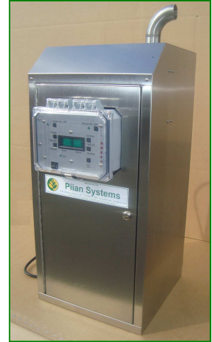
Piian Mini Vaporizer

The Piian Mini Vaporizer was developed by us over 10 years ago to solve the performance problems and high service costs of perfume sprayer type systems and the hidden electrical costs and safety issues associated with ozone generators.