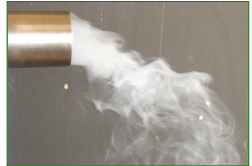
Piian Odor Neutralizing Vapor

Piian Odor Neutralizer has been independently tested and complies with all federal safety standards.