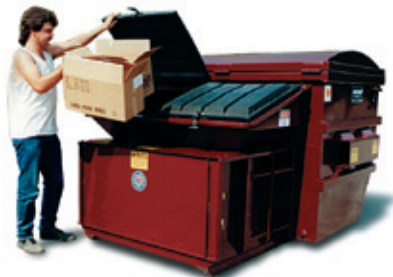
Pak'ntainer with optional hopper and plastic lids to keep contents in, rain out.