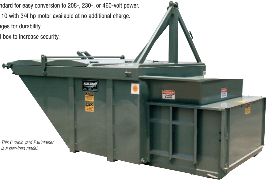
This 6 cubic yard Pak'ntainer is a rear-load model.