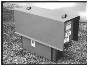
REMOTE POWER UNIT WITH WEATHER COVER: (STANDARD) Designed for easy maintenance.