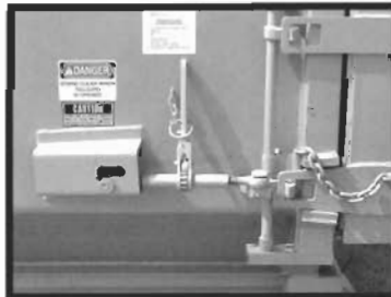
SLAM LATCH: Simplified design for door locking procedures. Ease and convenience for one operator closure.