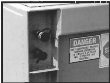
DRIP PAN: Eliminates oil spillage when hoses are disconnected for servicing or transportation

NOTE: Unless stated otherwise in writing, container sizes indicated on sales literature, invoices, price list, quotations, and delivery tickets are nominal sizes. Actual volume may vary from nominal sizes.