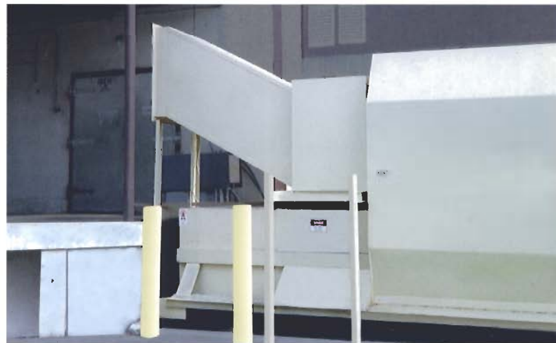
DOCK APPLICATION: Free Standing 45° Over the Rear Chute • Waste Disposal from Dock

WASTEQUIP ACCURATE FOCUSING ON CUSTOMER SATISFACTION