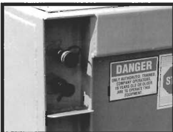
DRIP PAN: Eliminates oil spillage when hoses are disconnected for servicing or transportation