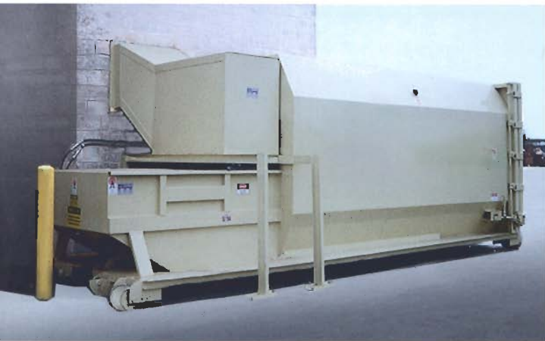
THROUGH THE WALL APPLICATION: Free Standing 45° Side Chute • Waste Disposal from Inside Building

Manufacturing Compaction Equipment Since 1973