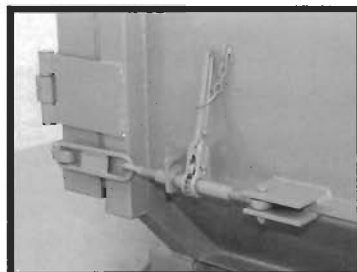
HINGED SIDE RATCHET BINDER: Loop style binder includes slotted hinges and positive door seal when tightened.

Winter Equipment Corporation 614 Florence Street Columbia, PA 17512