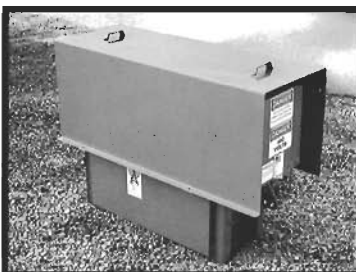
REMOTE POWER UNIT WITH WEATHER COVER: (STANDARD) Designed for easy maintenance.