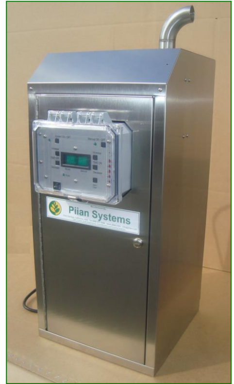
Odor Neutralizing Vapor System

Lowest Cost – Our system costs $1.00 per day to run. Expensive ozone generators consume $1000's in electrical power per year and require costly maintenance. Perfume systems don't work; they break and require frequent refills.