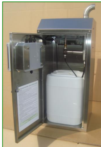
High Quality Components