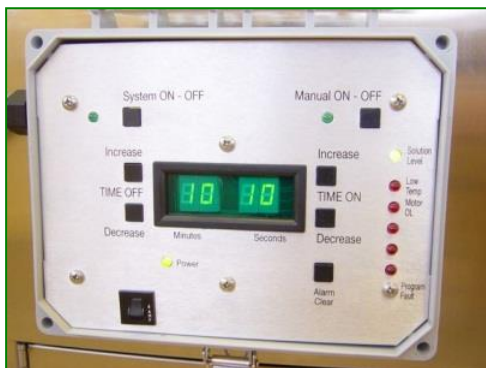
Easy To Use Digital Control Panel