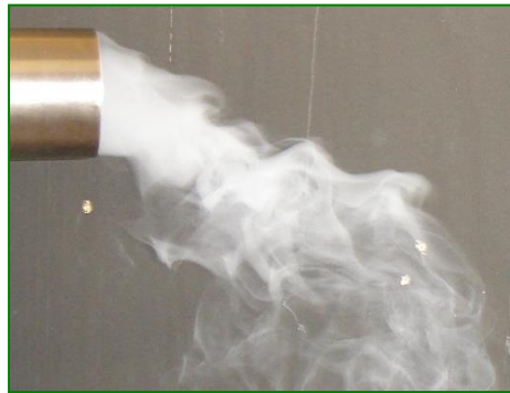
All Natural Piian Odor Neutralizing Vapor – Effective, Safe, Environmentally Friendly.